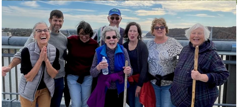
Some of Our Vestry on Retreat