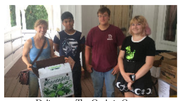
Delivery at The Guthrie Center

GRACE Church, an Episcopal Community in the Southern Berkshires